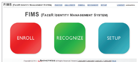
Animetrics FIMS Home Screen